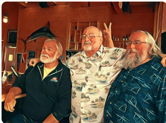
Portrait of Young boys at Riptide