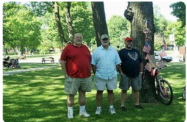
4th of July at Lake Park